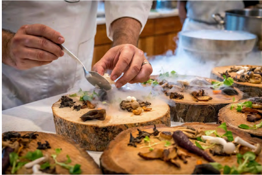
(for illustration only. Your actual lunch probably won't look like this. Probably.)

To sign up for tabling, or for more information, contact June Muto .