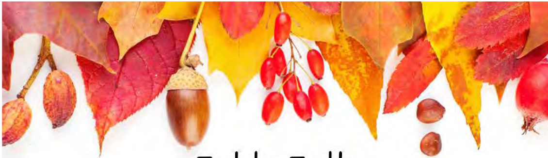
Table Talk with SOAR

You are invited to join us to eat and chat around the table!